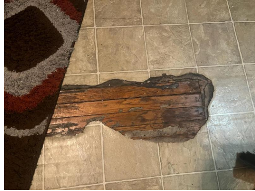
1521-2 Rolled Flooring/Mastic/Adhesive Interior Kitchen