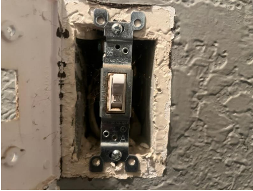
1521-1 Drywall/Joint Compound Typical Interior Walls/Ceilings