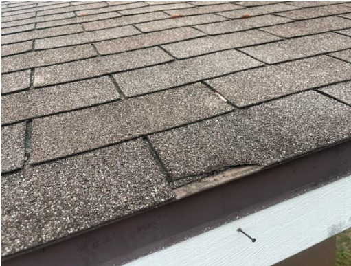
1521-3 Asphalt Shingle Typical Exterior Roof